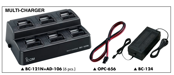
BC-121N MULTI-CHARGER + AD-106 CHARGER ADAPTER

MB-94: Alligator type. Same as supplied.